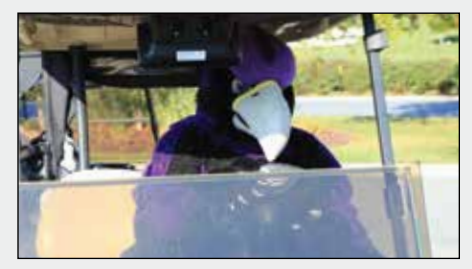
MC Raptor behind the wheel!