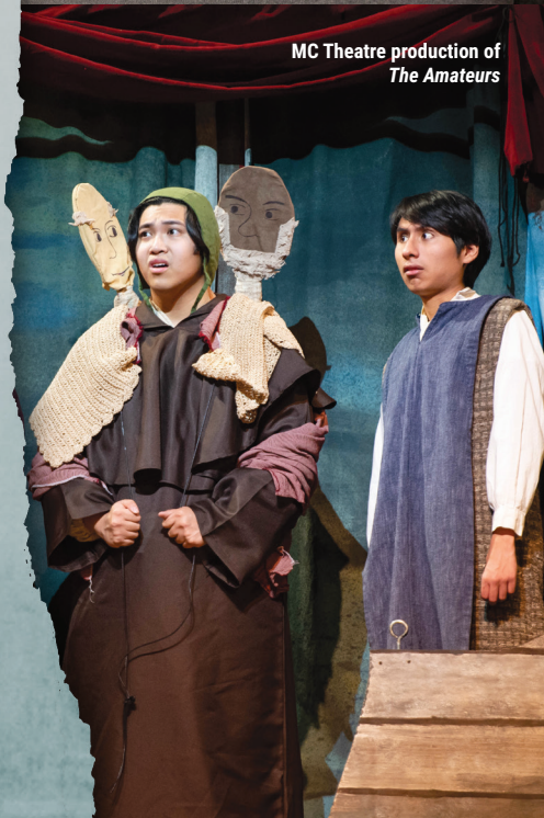
MC Theatre production of The Amateurs