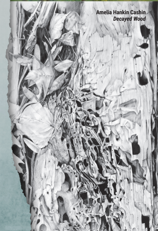
Amelia Hankin Cashin Decayed Wood